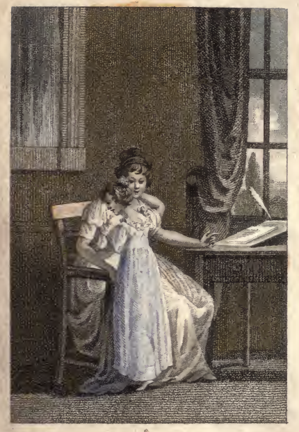
PUZZLE for a curious GIRL

London Publish'd by Tabart & C. Oct. 9-1804